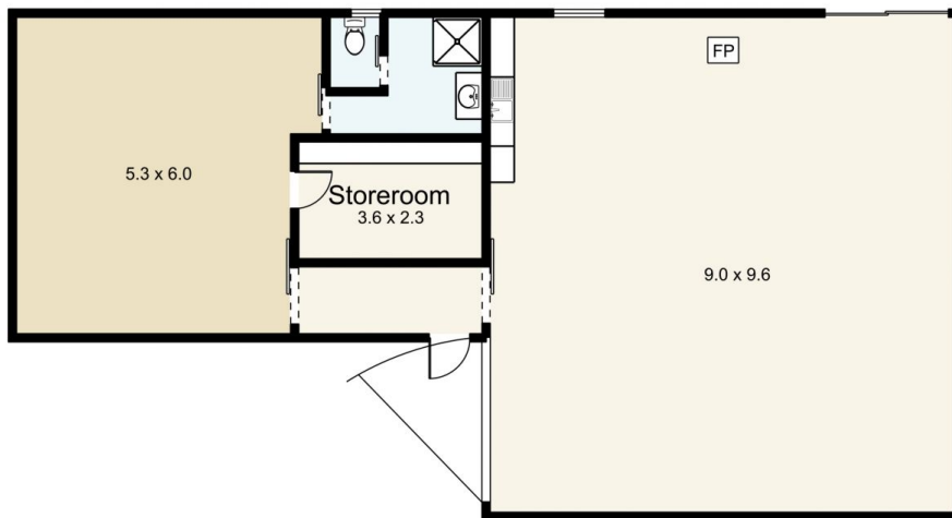
(Not Shown In Correct Location)